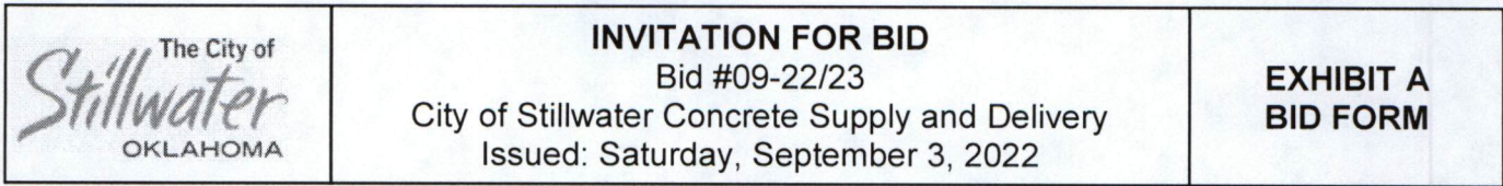
EXHIBIT A SPECIFICATION AND BID FORM

All materials shall comply with 2019 ODOT Standard Specifications, Section 701, Portland Cement Concrete.